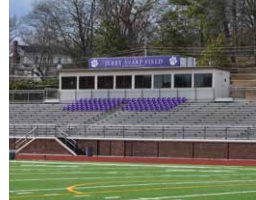
Darlington School Football Stadium

A group of boarding school students discover a suitcase full of money and a dead body in the mystery film The Double McGuffin (1979). One scene was filmed at the football stadium on the Darlington School campus.