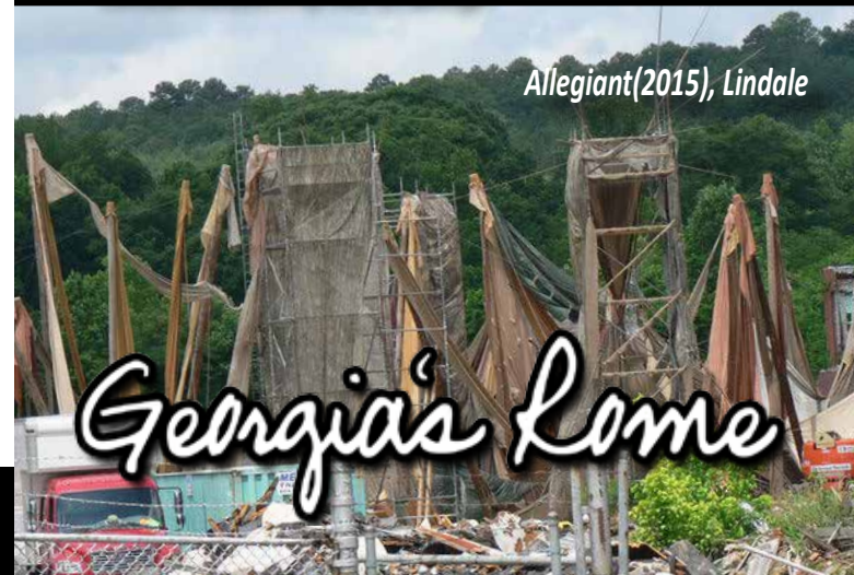
Allegiant (2015), Lindale