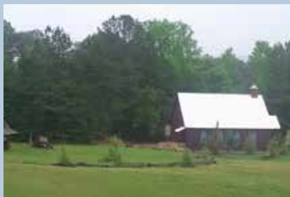
Big Texas Valley

This scenic farm land was the farm backdrop for Mosquito Coast (1986) starring Harrison Ford and Helen Mirren. This movie was one of Rome's first feature films.