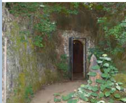
Cave Spring Cave

Tour tip: Request the Outdoor Adventure Guide from the Rome-Floyd Visitor Center for a map of Rome's extensive green and blue trail systems to view the bridge by foot or by water.