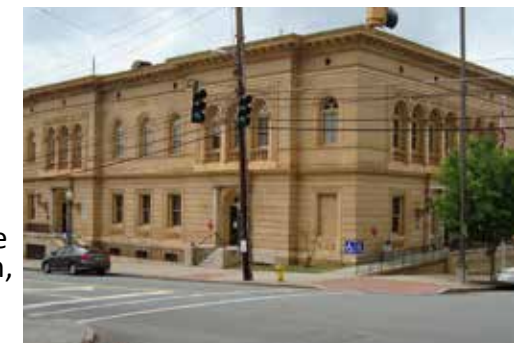
Floyd County Administration

If Loving You is Wrong (2016), a prime time television soap opera created, executive produced, written, and directed by Tyler Perry and premiered on the Oprah Winfrey Network. The building was a filming location for one of the episodes.