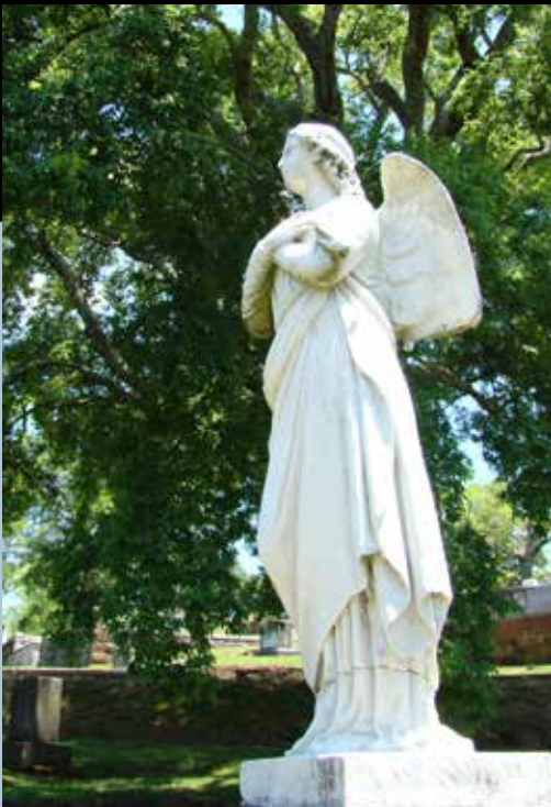
Myrtle Hill Cemetery