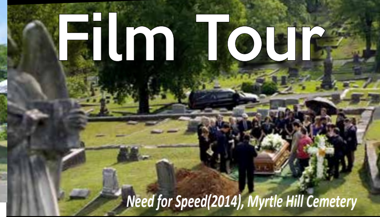
Need for Speed (2014), Myrtle Hill Cemetery