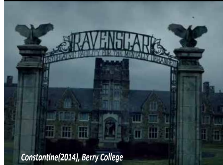
Constantine (2014), Berry College